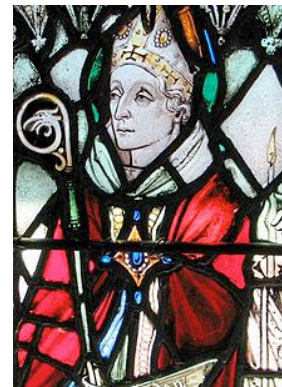
Above Left: King Edwin and St. Paulinus.

As sometimes happens with new converts, Hild decided that she would enter the monastic life, and set out to join her sister, Hereswith, at the monastery of Chelles, in Gaul. Hild was gone for a year, but returned at the request of Bishop Aidan, who gave her a small parcel of land on which she settled with a few other women. After this Hild was made abbess of the monastery at Hartlepool (Heretu), in county Durham, which she governed strictly for several years. Heiu, the first Northumbrian woman to enter the religious life founded Hartlepool in the 640's as a double monastery. Excavations of the monastery's cemetery in Hartlepool were conducted in 1833.