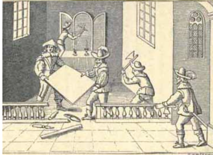
Above: Altar at Branscombe. Devon Below: Puritan Enthusiasm, 1543.

Altar rails were installed to protect altars when roodscreens or chancel screens that divided the altar area from the nave were removed from churches in the 16 th century. The rails were one of many targets for the anger of the Puritans. They disliked the idea that the altar was somehow sacred and destroyed the rails along with other hated objects.